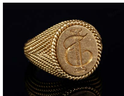
Lot 657 A ladies' gold signet ring, with a flat section oval head and rows of applied twisted wire to the shoulders and shank, with an hand engraved monogram, marked 750, marks possibly Austrian or Belgian, 15.20g, finger size H½ LE, together with a 9ct gold wedding ring, 5.44g, finger size O LE (2) £250 - 300