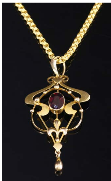
Lot 653 An Edwardian gold garnet set Art Nouveau pendant, with an oval mixed cut garnet, rub set to the centre. A whiplash frame with applied beads, a fleur-de-lys and pippin drop, suspended on a double belcher chain, marked 15. Pendant marked 15. 9.55g £80 - 120