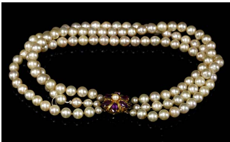
Lot 678 A three row uniform cultured pearl choker, with a gold and amethyst clasp. Three rows of uniform cultured pearls, 7.5 to 8mm in size, strung plain with a 5mm cultured pearl at the end of each row, to a three row box clasp with a marquise cut amethyst, claw set between textured arched bars. Marked 9ct. 337mm long £220 - 280