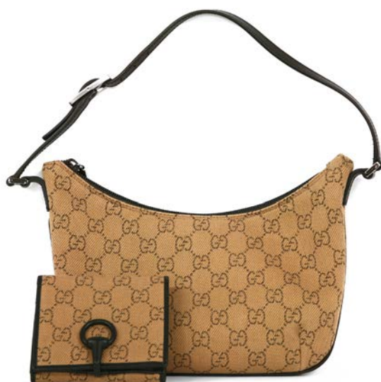
Lot 793 A Gucci tan monogram canvas shoulder bag, featuring the maker's classic monogram canvas in tan, with leather detailing, silver-tone hardware, brown fabric lining, together with a matching Gucci tan monogram canvas wallet, black leather detailing, flap-over clasp, sectioned interior and coin pocket (2) £180 - 260