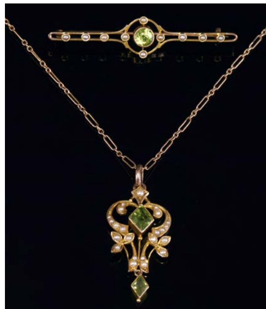
Lot 652 An Edwardian gold, peridot and split pearl pendant, with a lozenge, step cut peridot, milligrain set to the centre, a scrolling whiplash frame, grain set with split pearls with a peridot pendant drop, suspended on a gold fetter chain with a barrel clasp, pendant marked 9ct, chain marked 15ct, 42mm long including bale, 6.42g, together with a matched Edwardian peridot and split bar brooch, 55mm long, 2.93g (2) £100 - 150