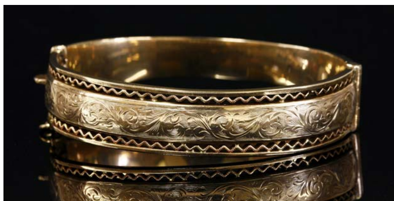
Lot 644 A 9ct gold hollow hinged bangle, with a 'D' section top half, with a hand engraved central band. Pierced zigzags to each side, with plain guards, to a plain tapered lower half. Birmingham, 1970. 58 x 54mm, 19.72g £150 - 200