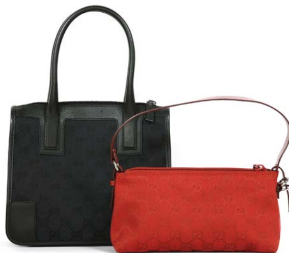
Lot 792 A Gucci red monogram canvas shoulder handbag, featuring the maker's classic monogram canvas in red, with leather detailing, silver-tone hardware, black fabric lining, with dustbag. ID no. 103399001013, together with a Gucci black monogram canvas mini shopper handbag, featuring the maker's classic monogram canvas in black, with black leather detailing, zip fastening, dual rolled handles, fabric lining. ID no. 0000856002122 (2) £160 - 240