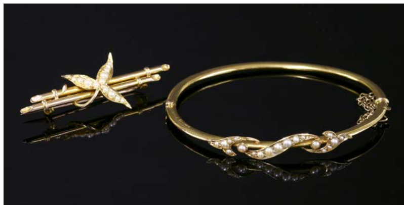
Lot 640 A 15ct gold Victorian split pearl hinged bangle, with applied foliate scroll, grain set with split pearls, a hollow chevron section bangle, with a concealed box clasp and safety chain, Birmingham, 1898, 56 x 47mm, 4.96g, together with a split pearl gold bar brooch, c.1900, with two staggered bars and an applied leaf. Marked 15ct. Brooch 48mm long, 3.56g (2) £80 - 120