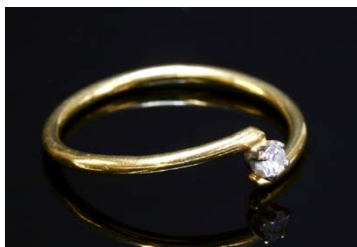
Lot 667 An 18ct gold single stone diamond stacking ring, c.1970, with a brilliant cut diamond, four claw set to a plain collet with crossover round wire section shoulders. London, 1975. Maker's mark unidentified . 1.21g. Finger size J½ £50 - 60