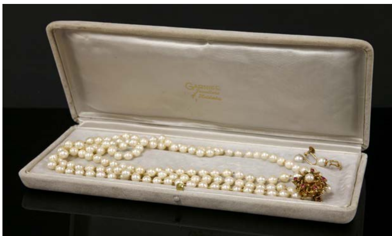
Lot 676 A single row uniform cultured pearl necklace, strung knotted continuous to a 9ct gold cultured pearl and ruby two row separator in the form of twigs, with a single cultured pearl peg set and sectioned rubies, 8.88g, together with a pair of cultured pearl earrings, with screw back fittings, marked 18k. Tested as approximately 18ct (3) £150 - 180