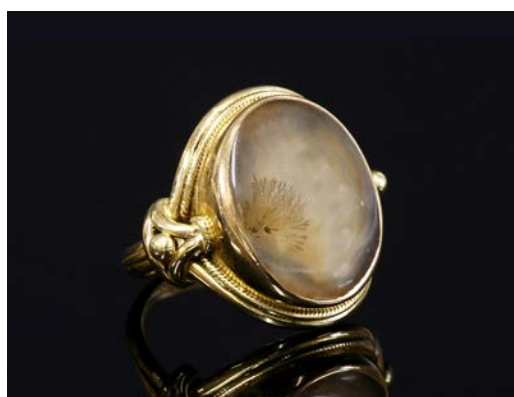
Lot 656 A gold single stone moss agate ring, an oval cabochon moss agate, rub set with a closed back, to a rope and polished wire border, looped wire shoulders, with a bead centre and a two roll shank. Tested as approximately 18ct gold. 8.08g. Finger size M½ £100 - 150