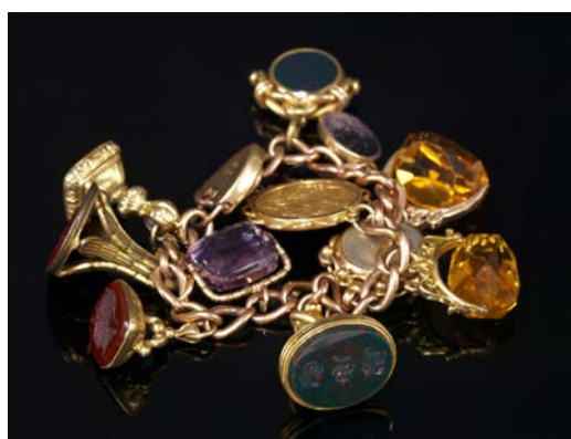
Lot 655 A 9ct gold curb link charm bracelet, with a later 9ct gold padlock clasp, with eleven assorted charms attached to include a 1914 full sovereign, channel set in a scalloped edge mount, a 9ct gold bloodstone seal with a pair of entwined snakes or serpents forming the mount and intaglio engraved initials. 91.82g £550 - 600