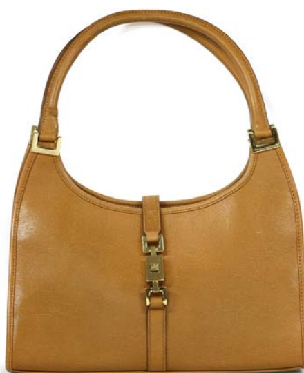
Lot 794 A Gucci 'Jackie' tan leather handbag, a classic shoulder bag in tan leather, with dual rolled handles, gold-tone hardware and clasp, zip pocket interior. With dust bag, ID no. 002 1068 2400 £80 - 120