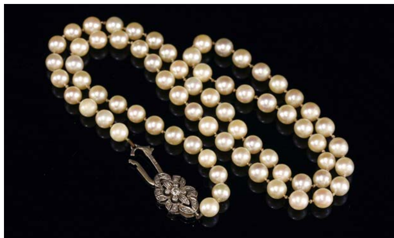
Lot 677 A single row uniform cultured pearl necklace, with a 9ct white gold diamond set clasp. A single row of uniform cultured pearls, 6 to 6.5mm in size, strung knotted to a single row elongated haxafoil cluster safety clasp, with a brilliant cut and eight cut diamond. London, 1981. 25.93g £100 - 130