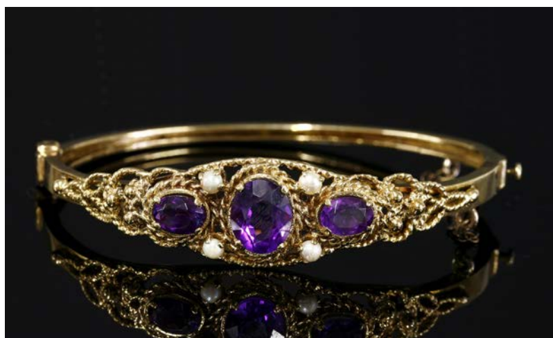
Lot 665 A Victorian-style amethyst and split pearl hinged bangle, with three oval graduated mixed cut amethysts, claw set between pairs of cultured split pearls, all to a decorative rope and bead frame, with a flat section hollow bangle, concealed box clasp and safety chain. Tested as approximately 9ct gold. Interior dimensions 5.6 x 4.5cm £150 - 250