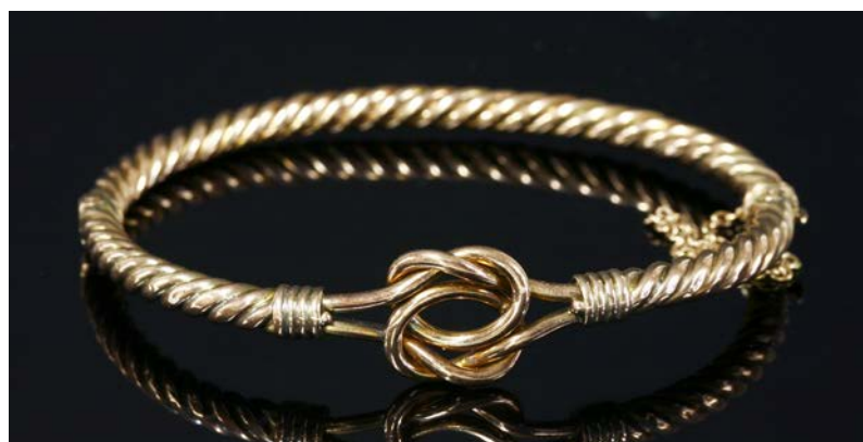
Lot 643 An Edwardian knot bangle, with a double overhand knot centrepiece, to ridged end caps and a hollow, hinged rope bangle, with concealed box clasp and safety chain. Tested as approximately 9ct gold. 57 x 48mm, 9.33g £80 - 120