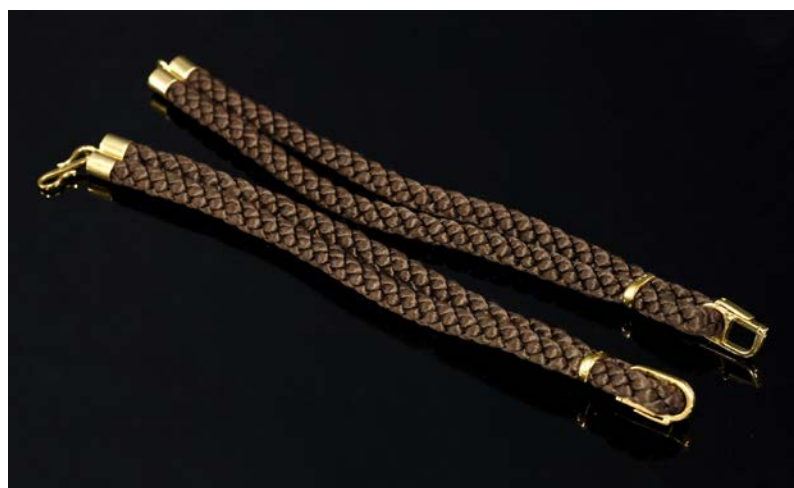
Lot 666 A pair of brown silk cord bracelets, with gold end caps and fittings, with a hinged catch and hook clasp, one deficient (2) £80 - 120