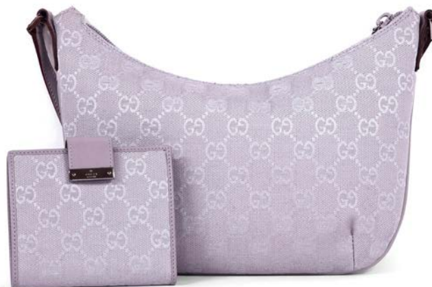
Lot 796 A Gucci lilac monogram canvas shoulder bag, featuring the maker's classic monogram canvas in lilac, with leather detailing, silver-tone hardware, brown fabric lining, ID no. 32160 3444 with dust bag, together with a matching Gucci lilac monogram canvas wallet, lilac leather detailing, silver-tone hardware and sectioned interior (2) £120 - 180