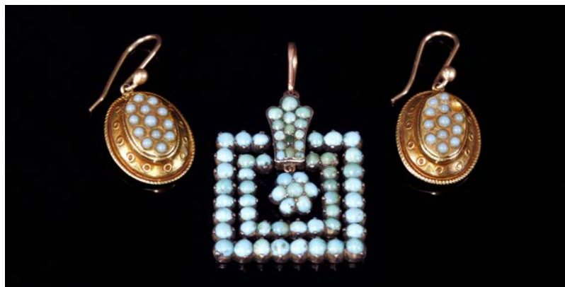
Lot 651 A silver gilt square turquoise set pendant, c.1900, with a turquoise set flower cluster, suspended to the centre, with two concentric square frames, all in cut down collets, 45 x 25mm, 7.54g, together with a pair of Victorian-style 9ct gold drop earrings, Birmingham, 1969, set with blue paste cabochons. 2.63g (3) £100 - 130