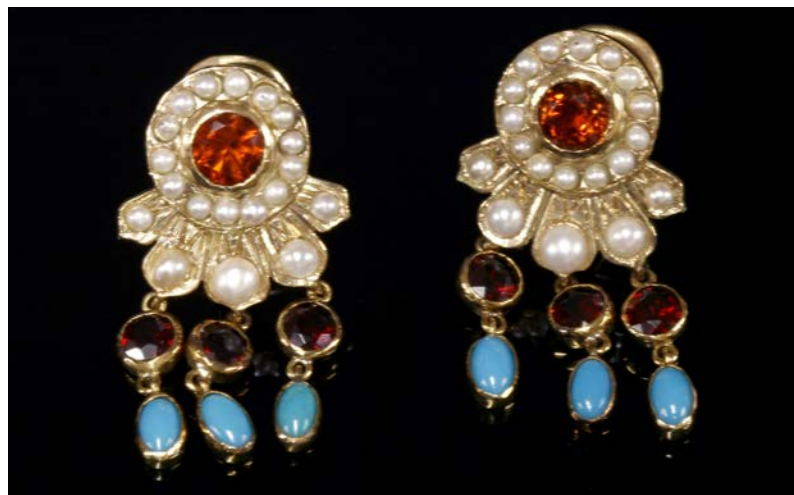
Lot 664 A pair of gold, garnet, cultured pearl and turquoise drop earrings, a hessonite garnet to the centre with a border of graduated cultured pearls, with a cultured pearl spray and a fringe of rub set pyrope garnets and turquoise cabochons, to post and Omega fittings. Tested as approximately 9ct gold, with Omega fittings tested as approximately 18ct gold. 31 x 16mm, 9.45g (2) £100 - 150