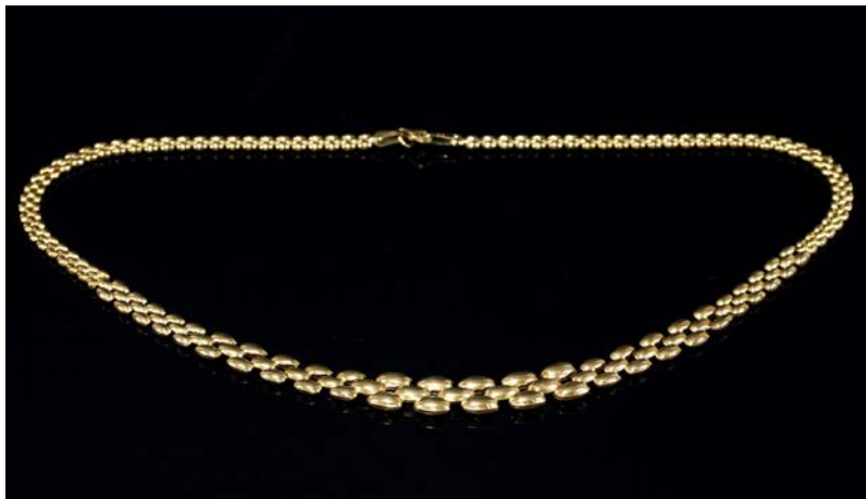
Lot 674 A 9ct gold two row graduated hollow panther link necklace, with a side lever clasp. Birmingham. 435 x 10.2mm, 8.70g £250 - 300