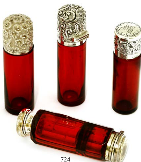
Lot 724 Four silver and cranberry glass scent bottles, to include a double-ended example with faceted glass and silver screw and hinged lids, 8cm long (4) £300 - 500