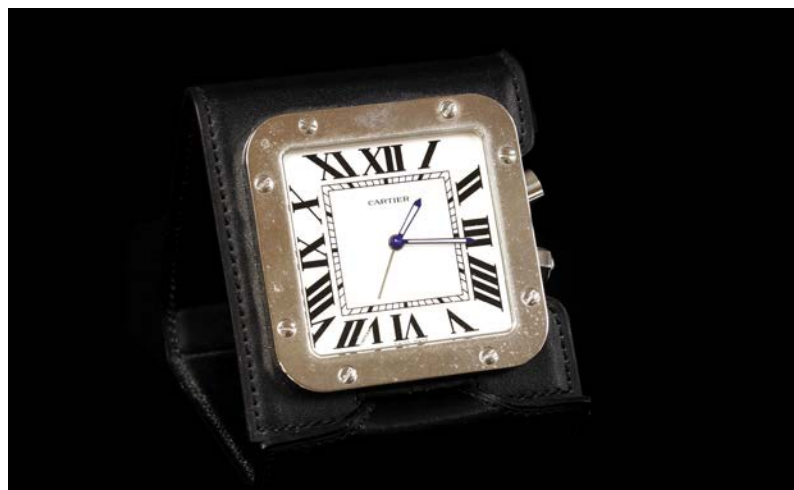
Lot 679 A stainless steel Santos de Cartier travel clock, with white dial, black Roman numerals and luminous hands. With black leather folding case, box and papers dated 2004. Serial no. 002009UM 2750 £300 - 500