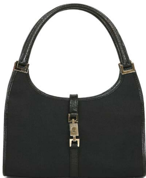
Lot 791 A Gucci 'Jackie' black leather and canvas handbag, a classic shoulder bag in black canvas with leather detailing and dual rolled handles, silver-tone hardware and clasp, zip pocket interior. With dust bag, ID no. 002.1068001998 £90 - 120