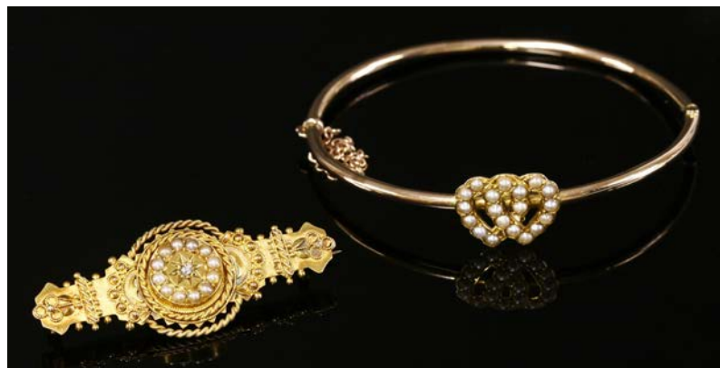
Lot 641 An Edwardian gold, split pearl hinged bangle, with a pair of entwined twin hearts, grain set with a row of split pearls, to a hollow tubular bangle, with a concealed box clasp and a safety chain, 56 x 47mm, 4.98g, together with a 15ct gold Victorian, diamond and split pearl Etruscan-style brooch, a raised central boss with a star set old eight cut diamond, surrounded by a row of split pearls with twisted wire and applied bead decoration, Chester 1898. Brooch 47mm long, 4.95g (2) £200 - 250