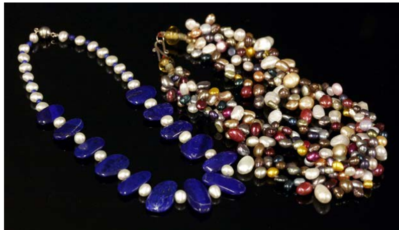
Lot 675 A single row lapis lazuli and cultured freshwater pearl necklace, with freeform lapis lazuli cabochons, strung between cultured freshwater pearls, to a magnetic clasp, together with a four row cultured freshwater pearl torsade necklace, with a hook clasp (2) £200 - 250