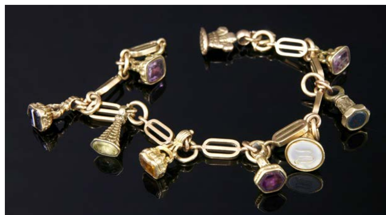
Lot 654 An Art Deco 9ct gold open three row bar and hoop link bracelet, with eight assorted gold cased miniature seals and a fleur-de-lys charm, to include an amethyst, banded agate, citrine, and bloodstone examples. 23.98g £180 - 280