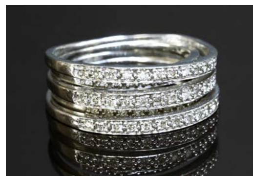
Lot 668 A 9ct white gold five row diamond band ring, with three raised, staggered rows, all grain set with brilliant cut diamonds. Marked .50, believed to be the known total diamond weight. 6.11g. Finger size O £180 - 250