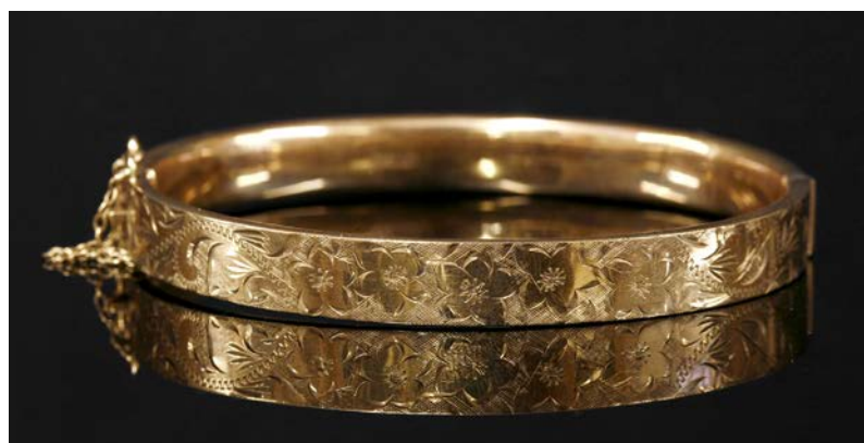
Lot 645 A 9ct gold hinged bangle, by Cropp & Farr, of hollow, flat section form, with hand engraved floral decoration to the top half. Plain flat guards to a concealed box clasp with safety chain. Birmingham, 1972. A bangle case by 'Plante, 12 Bury Street, London SW'. 61 x 54 x 8.1mm, 10.56g £80 - 120