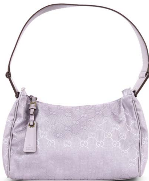
Lot 795 A Gucci purple monogrammed canvas shoulder handbag, woven monogrammed canvas with purple smooth leather detailing and handle, zip fastening with zip pocket to the interior and dust bag, ID no. 60216696 together with a Gucci black patent leather mini shoulder handbag, with silver-tone hardware, single rolled handle and fabric lining, ID no. 00508171705 (2) £80 - 120