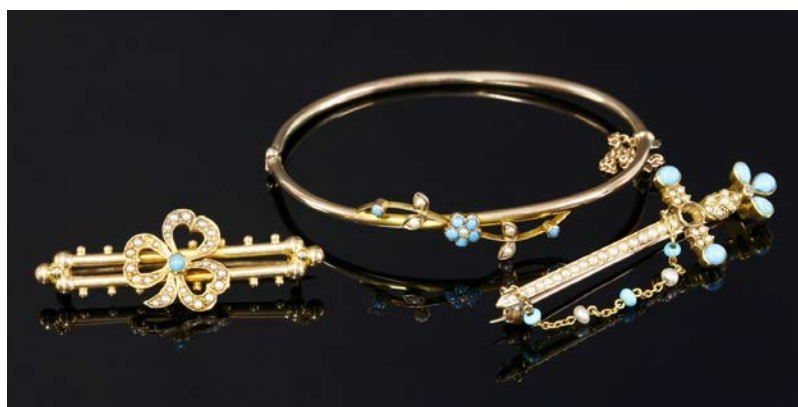
Lot 642 An American gold split pearl and turquoise hinged bangle, c.1905, with an applied split pearl and turquoise forget-me-not, with leaf and blade edge vines, the central motif to a hollow tubular hinged bangle, with concealed box clasp and safety chain, bangle marked 10ct, 4.95g, together with a late Victorian turquoise, diamond and split pearl sword brooch, with a chain swag, brooch tested as approximately 18ct gold, 5.97g, and a late Victorian gold turquoise and split pearl shamrock brooch, brooch marked 15ct, 5.26g (3) £180 - 250